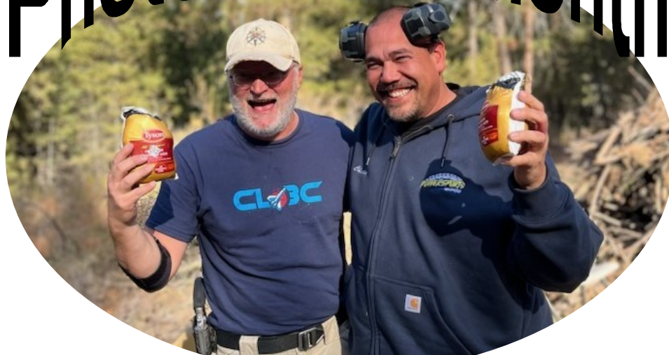
Photo of the Month