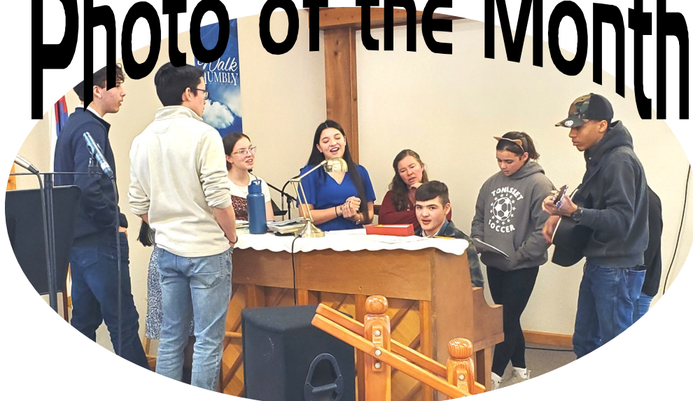
TBF & Loomis kids jam together at recent Mission Trip.