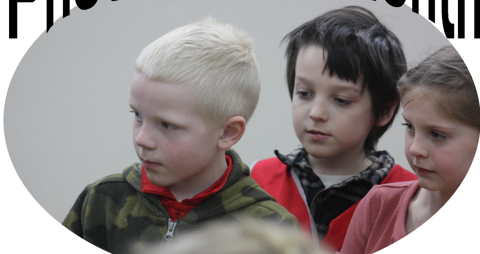
Competition was tight at the Awana Grand Prix, as evidenced by the focus of these junior bystanders.