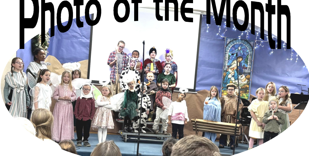
Photo of the Month

A precious reminder of this year's Christmas program. If you missed it, here's your hint of how good it was.